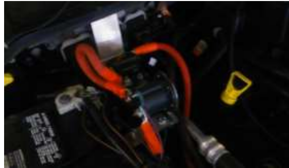
Typical Ford Installation on Passenger Side of Engine Compartment 2016 and Prior