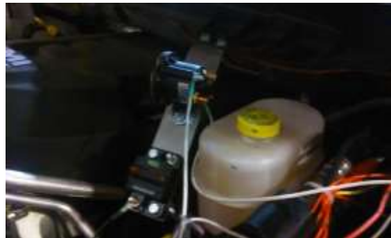
Typical Dodge Installation on Driver Side of Engine Compartment