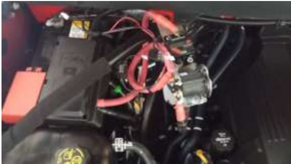
Typical GM Installation on Passenger Side of Engine Compartment

Install Circuit Breaker and Solenoid on Bracket as Shown. If Bracket Cannot be Used Choose a Location Where Circuit Breaker and Solenoid Will Be Protected From Being Damaged or Terminals Contacting Parts of Vehicle.