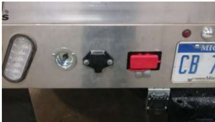
Typical Flatbed Installation