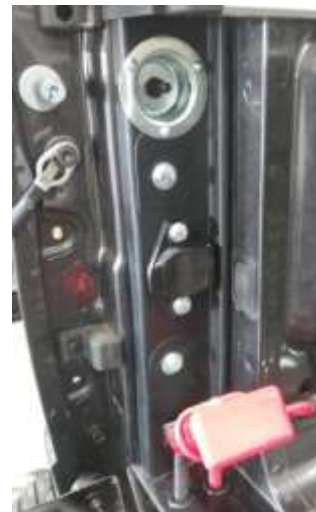
New Ram Box Installation