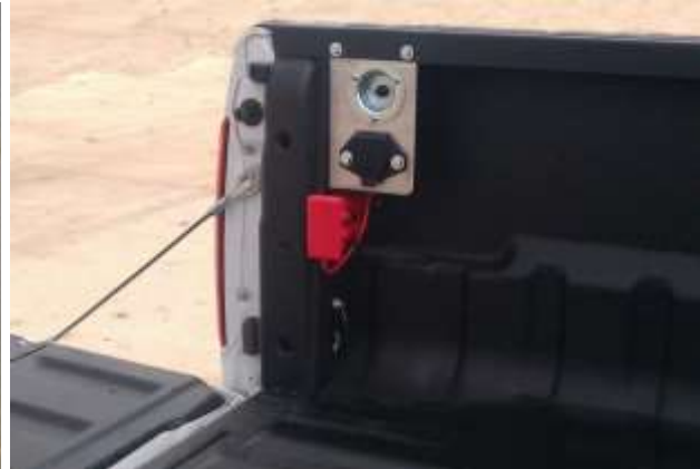
Typical Switch Plate Installation