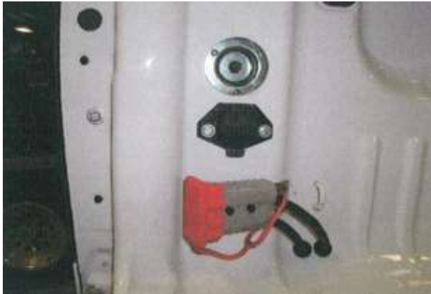
Typical In Box Wall Installation

Install Remote Switch and Plugs on Drivers Side, Inside of Box, At Rear.