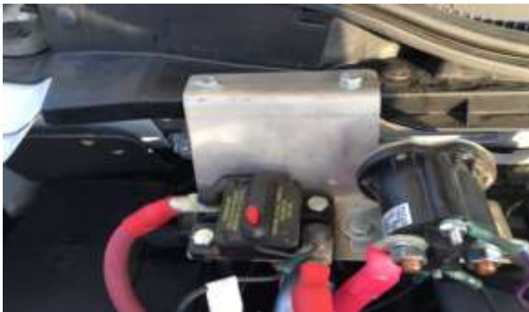
Typical Ford Installation on Passenger Side of Engine Compartment 2017 - Current