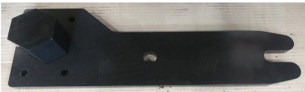
↑ Flat Edge Of QD Arm